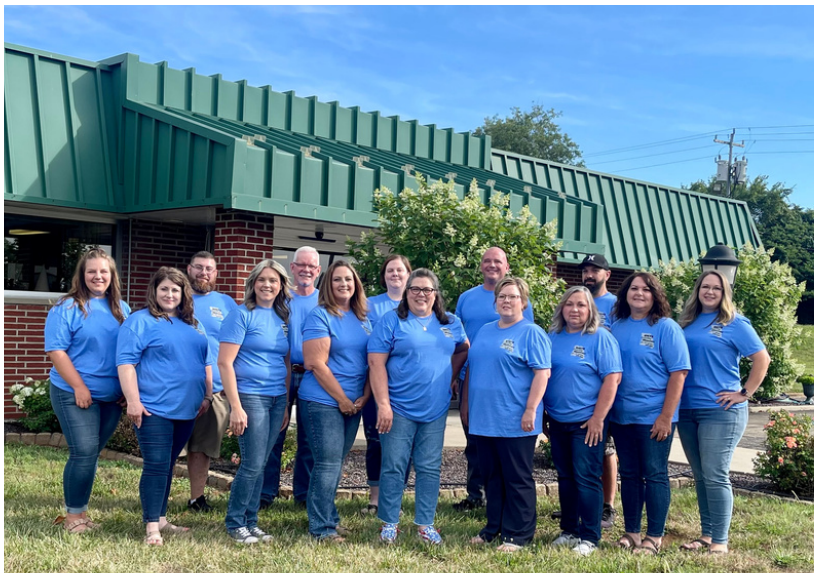
Fredericktown Office Staff